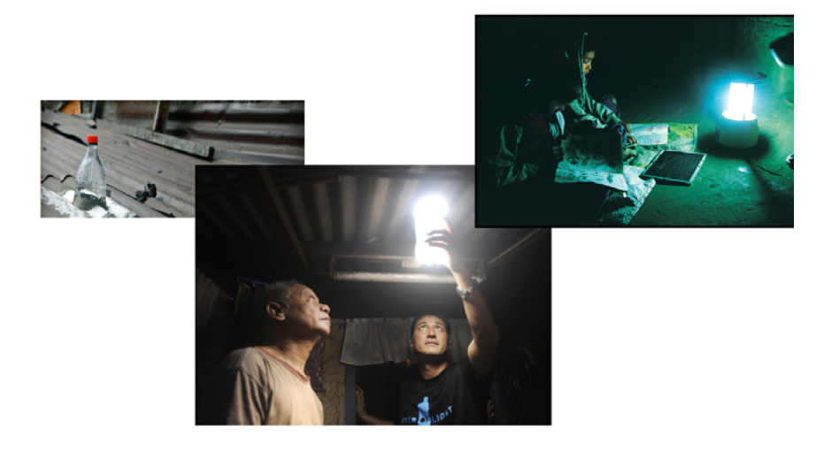
Figure 3. Alternative sources of energy from bio lamps/ LED lamps

lamps' (Fig. 3) are a promising means of supplying a free and eco-friendly source of energy during daylight hours, thereby significantly reducing energy costs and consumption.